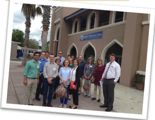
Center for Peace staff and volunteers host group of Christian leaders at Masjid Al-Rahman for tour and presentation about Islam