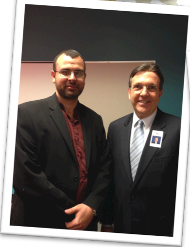
Center for Peace Director meets with Seminole County Public School Superintendent as part of Interfaith meeting