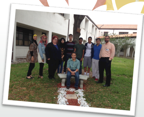
Center for Peace Junior Club at University High School