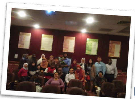
The Pursuit of Peace & New Muslim Support Class weekly on Saturdays at 10am-1pm