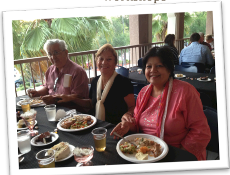
Next Open House Invitational scheduled for Saturday, April 25 th at 5:30pm Invitationals2015.eventbrite.com