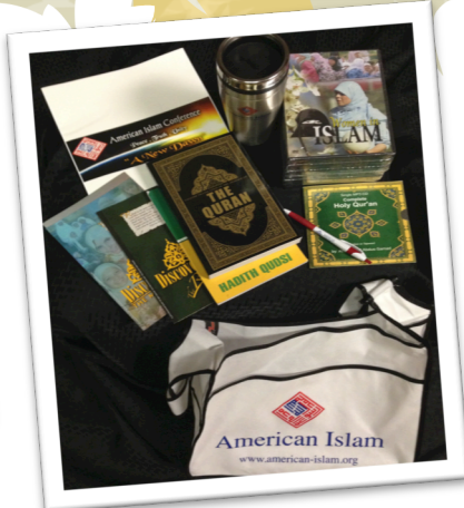
The C4P offers Convert Kits that include educational material and gifts to help our new members with their pursuit for peace