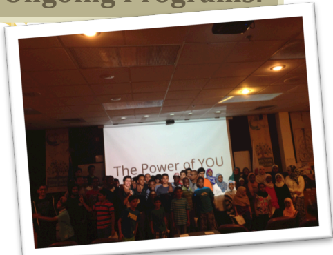
The Center for Peace held the annual Youth Dawah training for youth from the community and LPS discussing best practices on answering questions about Islam to our neighbors. Over 150 youth participated in the workshops