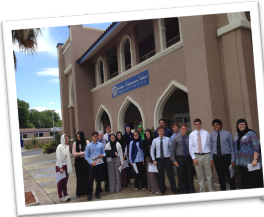
Center for Peace staff and volunteers welcome students from Trinity Prep. School for a presentation and tour about Islam. Other groups included Christian Pastors from the Latino community, Valencia College Students and visits to Eastern Florida College