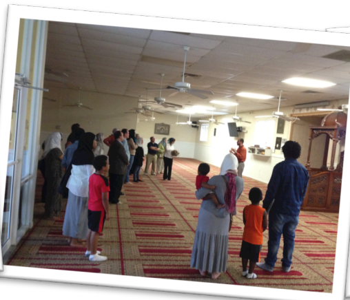
The Center for Peace team hosted members of the public for the monthly Open House Invitational with a tour of the Masjid, presentation about Islam and international dinner