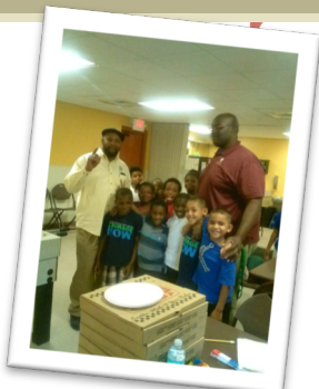
Masjid Al-Rahim Dawah Committee providing lunch for kids at local Ivey Lane Park community Center