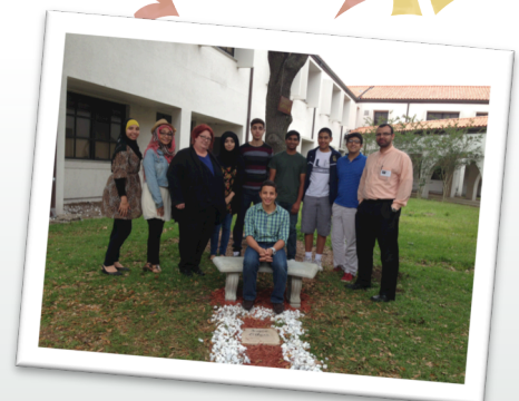
Center for Peace Junior Club at University High School