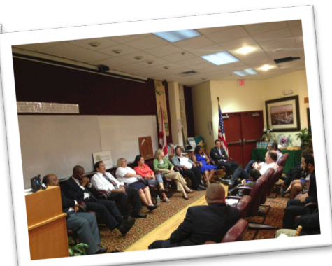
The Center for Peace in partnership with Emerge USA hosts a candidate format to help the community get to know 11 candidates running for office. Candidates for Senate, Congress, School board and others were represented