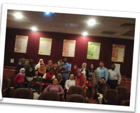
The Pursuit of Peace & New Muslim Support Class weekly on Saturdays at 10am-1pm