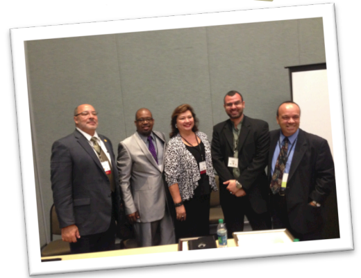
The Center for Peace Director participates in panel discussion on discrimination and respect in our community at the Latino Leadership Summit in the University of Central Florida.