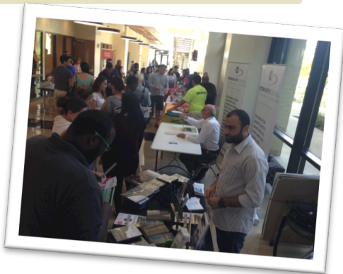
Peace Ambassadors set up educational outreach booth at Valencia College in the Lake Nona campus. Distribution of educational DVD's, brochures and copies of the Quran in English and Spanish to students, faculty and staff.