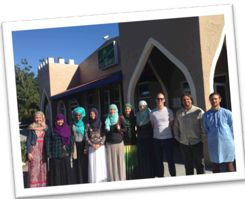
As part of the weekly Masjid tours, the Center for Peace welcomes the HEART Institute from Lakeland to Masjid Al-Rahman for a dialogue about Islam and Muslims.