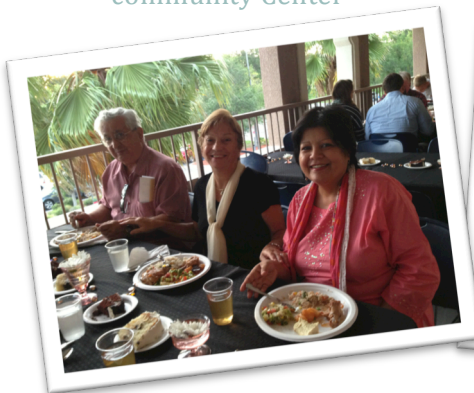
Next Open House Invitational scheduled for Saturday, November 22nd at 6:00pm Invitationals2014.eventbrite.com