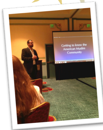
Center for Peace Director provides Cultural Sensitivity Training to Orlando Police Department Lieutenants to help clarify Muslim behavior and beliefs from prayer format to dress code of modesty.