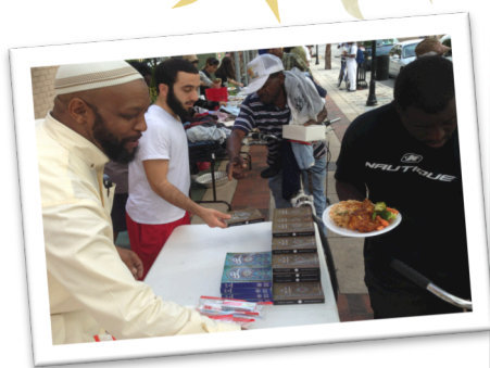
C4P Downtown Dawah Project-provided Free food and Qur'ans in partnership with the Muslim Social Services in Downtown Orlando