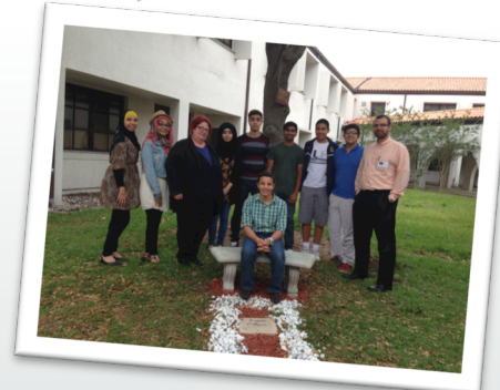
Center for Peace Junior Club at University High School