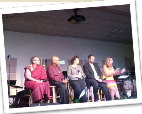
Center for Peace Director attends 9/11 Interfaith Service at Unity Church in Fort Lauderdale. The panel included a Rabbi, a Priest and a Buddhist Monk. Following the panel was a presentation about Islam and the Muslim American community