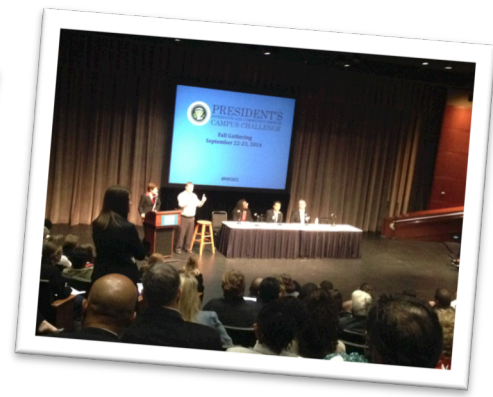
The Center for Peace Director attends the Presidents Interfaith Challenge conference in Washington D.C. to join the work of Interfaith nation wide