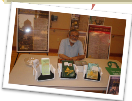
Masjid Al-Rahman Dawah Committee setting up booth at local community Center for distribution of Dawah Material