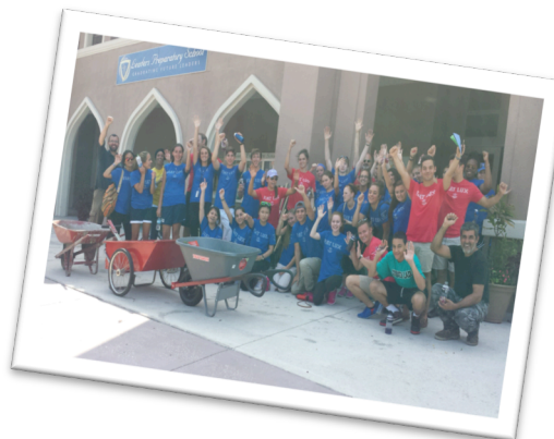
Rollins College students Volunteering at Masjid Al-Rahman on SPARC Day with cleanups of the Peace Garden and landscaping around the Masjid