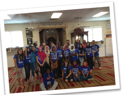
Interfaith Youth Group visits Masjid Al-Rahman for a presentation about Islam that included a tour of the Masjid and the Center for Peace. In addition, visitors met with a few Muslim students from Leaders Preparatory School