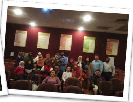
The Pursuit of Peace & New Muslim Support Class weekly on Saturdays at 10am-1pm