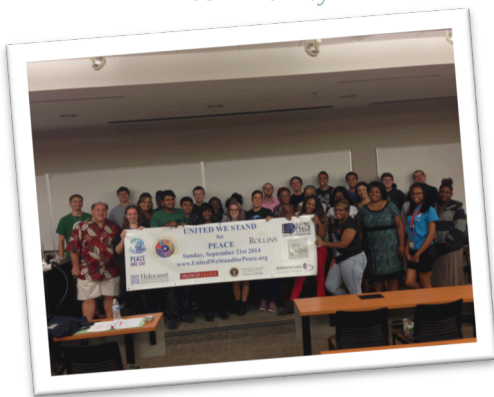
Peace Film Screening at Seminole State College for International Day of Peace as part of the United We Stand for Peace Initiative program through the Center for Peace