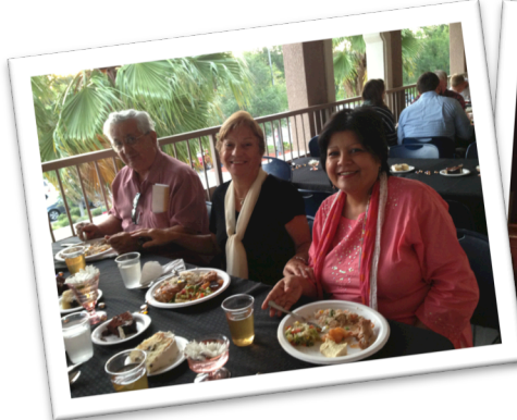
Next Open House Invitational scheduled for Saturday, October 25 th at 5:30pm