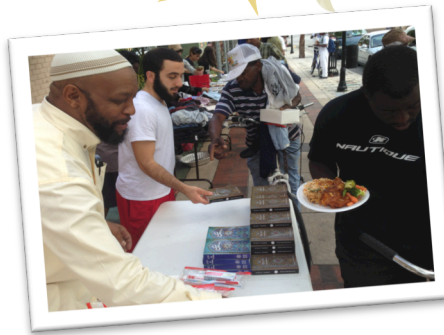
C4P Downtown Dawah Project-provided Free food and Qur'ans in partnership with the Muslim Social Services in Downtown Orlando